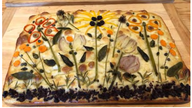
Focaccia Bread