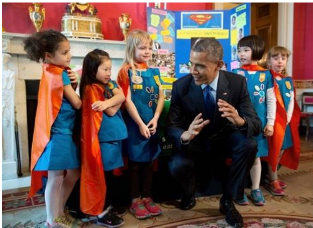
President Obama proclaiming Women's History Month 2016

As we approach March, let us be mindful of the origins and purpose of both International Women's Day (IWD) and Women's History Month. In 1975, the United Nations declared International Women's Day (IWD) and decided upon 8 March for its annual celebration world-wide. Thirty-six years later, in 2011, President Barack Obama proclaimed that the whole of March should be "Women's History Month," calling on Americans to mark IWD by reflecting on "the extraordinary accomplishments of women" in shaping the country's history.