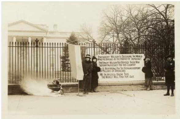
NWP watchfires burn outside White House, January 1919 (Library of Congress)

https://depts.washington.edu/moves/NWP_project_ch4.shtm