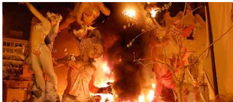
Photo: The last night of Las Fallas festival all of the larger-than-life effigies are burned. Each neighbourhood of the city has an organised group of people, the Casal faller, that works all year long holding fundraising parties and dinners to raise funds to construct the Fallas.

Please send me a copy of your personal elevator speech at pfsquire@gmail.com . I'd love to see your statement on AAUW. See you at the tea in March!