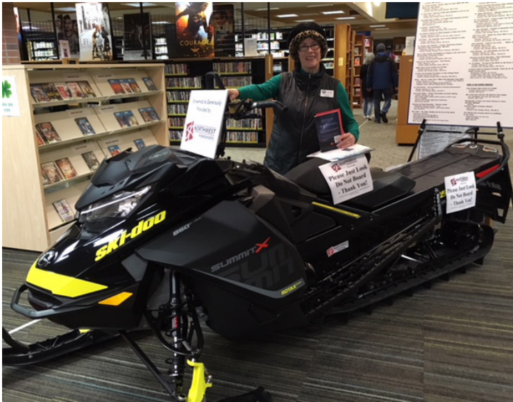
Photo: Pat standing by snowmobile brought in for LO Reads kickoff event in keeping with the book's Arctic setting.