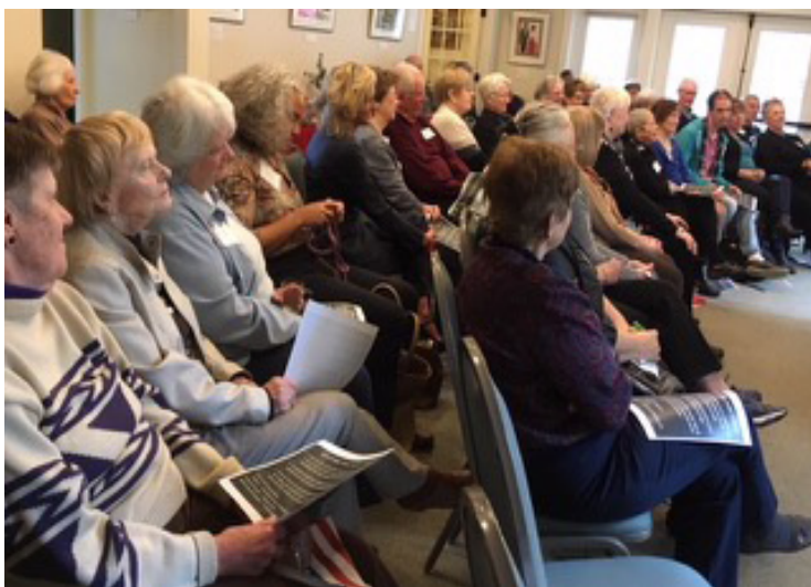
Photo: An extra large audience of community and branch members enjoyed the January presentation.

$20 per person goes to the Scholarship Fund Mail your checks to AAUW, P.O. Box 416, Marylhurst, OR 97036 or pay at the February branch meeting.