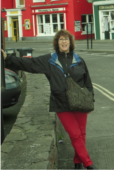
Scouring the world for ideas to bring back to AAUW Lake Oswego.