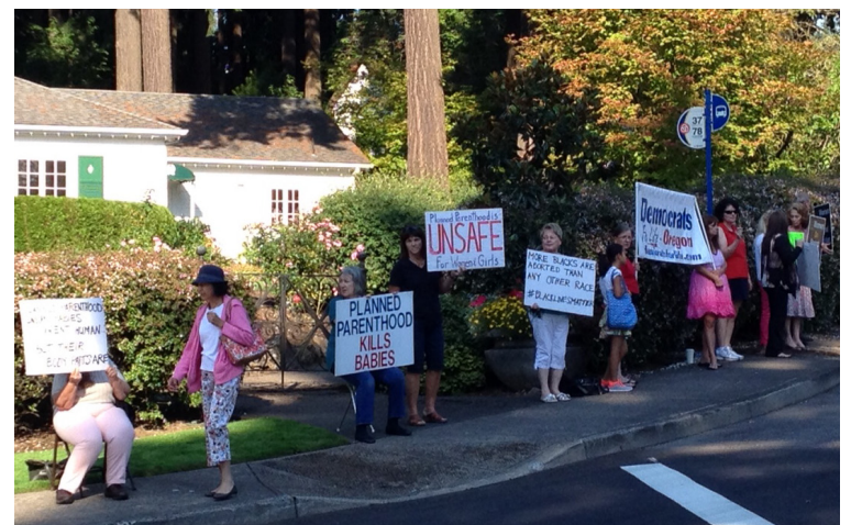
Protestors outside Heritage House on September 12.

During the question and answer session that ended the presentation, protestors placed flyers on car windows and invaded the meeting.